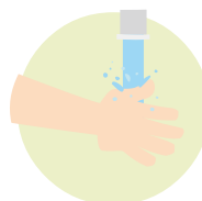
WASH YOUR HAND