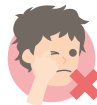
AVOID TOUCHING FACE